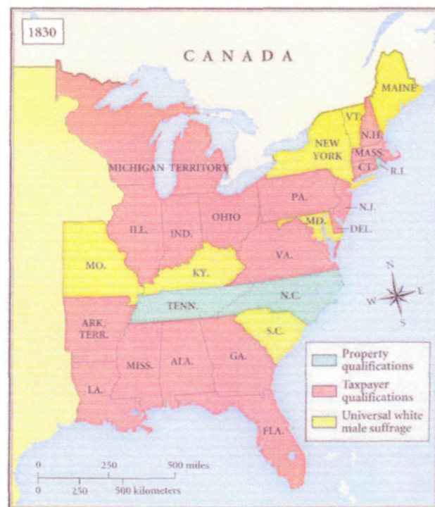
MAP 9.1 The Expansion of Voting Rights for White Men, 1800–1830

Between 1800 and 1830 the United States moved steadily toward political democracy for white men. Many existing states revised their constitutions, replacing property ownership with taxpaying or militia service as a qualification for voting. Some new states in the West extended the suffrage to all adult white men. As parties sought votes from a broader electorate, the tone of politics became more open and competitive—swayed by the interests and values of ordinary people.