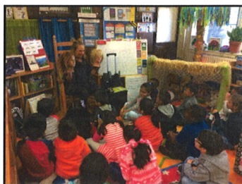
1st grade students learning about being a hairstylist from a volunteer from Parisian Beauty Academy.